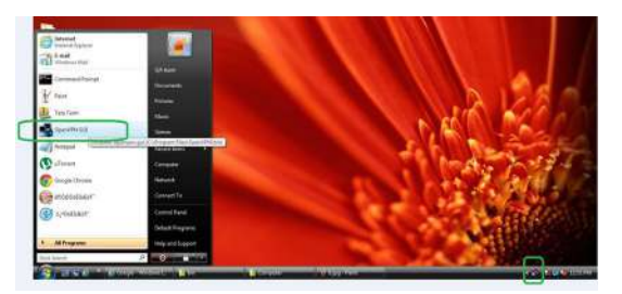
The OpenVPN icon displays in the Windows taskbar.

1. Launch the OpenVPN application with administrator privileges.