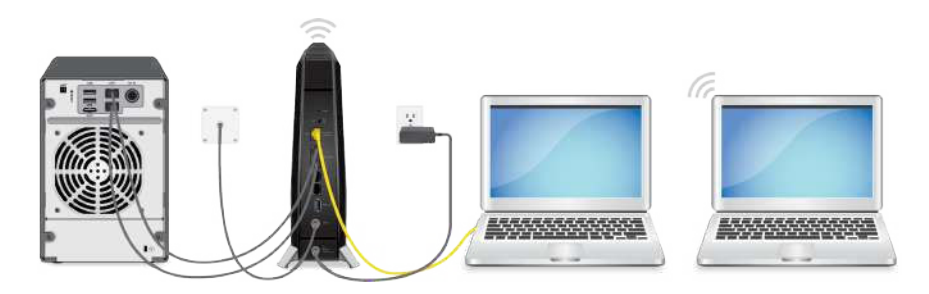
Figure 4. Ethernet port aggregation

WARNING: To avoid causing broadcast looping, which can shut down your network, do not connect an unmanaged switch to Ethernet ports 1 and 2 on your router.