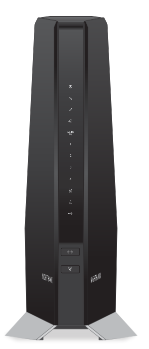
Figure 2. Modem router LEDs and buttons

You can use the LEDs to verify status and connections. The following table lists and describes each LED on the top panel of the modem router.