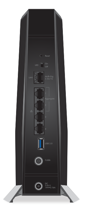
Figure 3. Modem router rear panel

The connections and button on the rear panel are shown in the following figure.