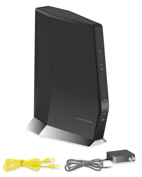
Figure 1. Package contents

Your package contains the modem router, Ethernet cable, and power adapter.